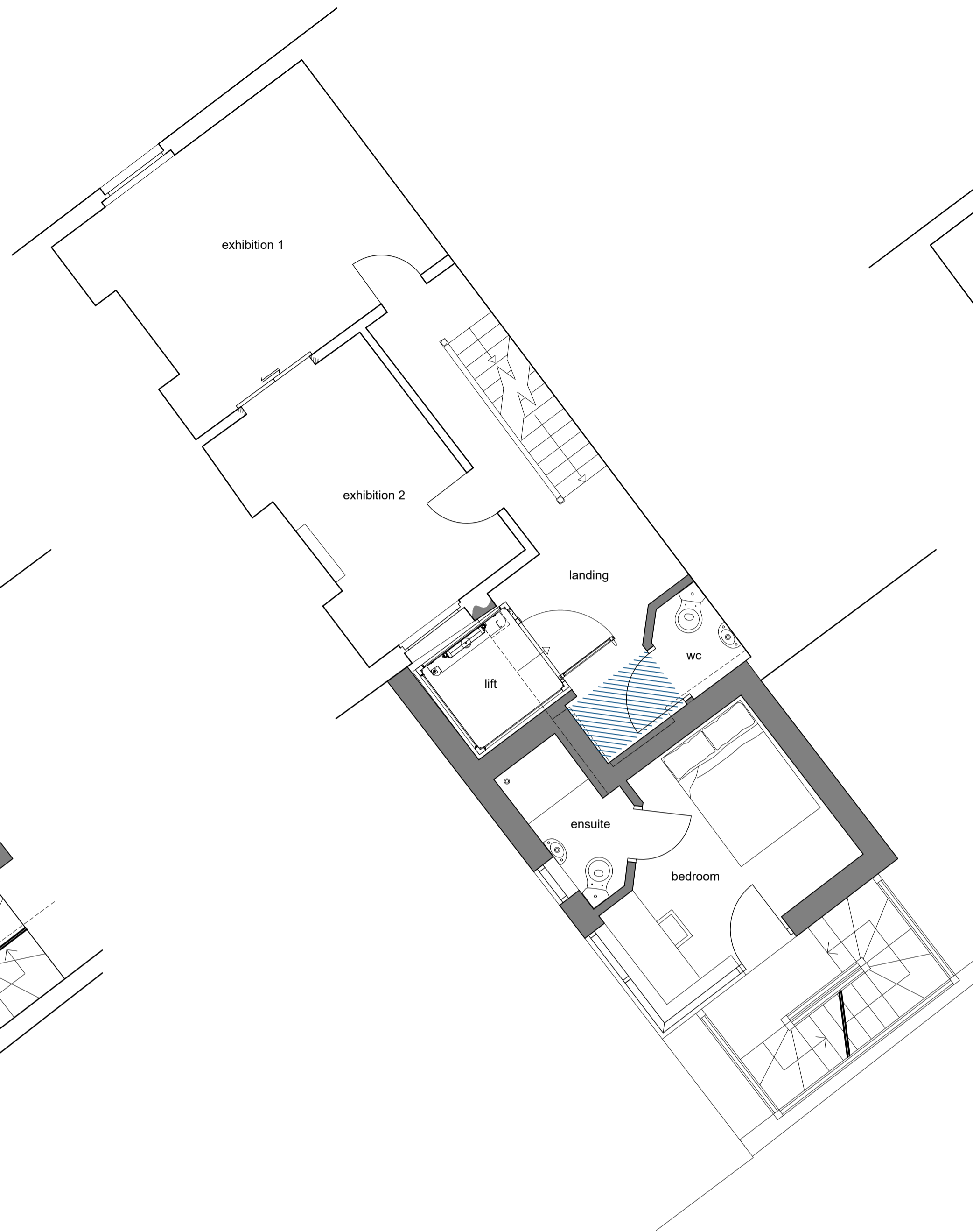
first floor plan scale 1:50